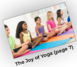
The Joy of Yoga (page 7)