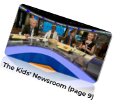
The Kids' Newsroom (page 9)