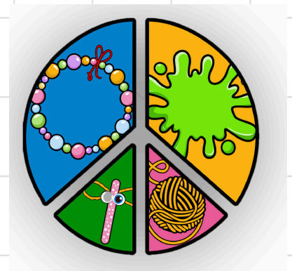
Beads, Slime and Crafty Times