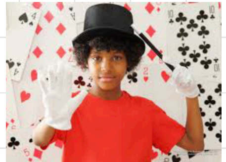
Magic In Motion: Enchanted Workshop